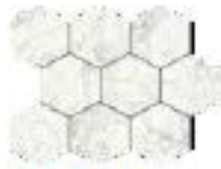
32NA20HEX NA20 Carrara Hexagon 4"x4" . 10x10 cm (sheet 10"x12" . 26x30 cm)