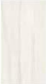
63NA05R NA05 Dolomite Rect. 12"x24" . 30x60 cm