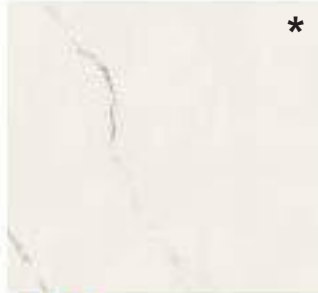
60NA07R NA07 Calacatta Gold Rect. 24"x24" . 60x60 cm