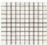
32NA05MO NA05 Dolomite Mosaic 1.4"x1.4" . 3x3 cm (sheet 12"x12" . 30x30 cm)