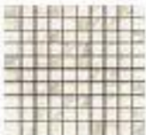
32NA07MO NA07 Calacatta Gold Mosaic 1.4"x1.4" . 3x3 cm (sheet 12"x12" . 30x30 cm)