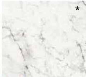
60NA10R NA10 Statuario Bianco Rect. 24"x24" . 60x60 cm