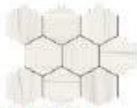
32NA05HEX NA05 Dolomite Hexagon 4"x4" . 10x10 cm (sheet 10"x12" . 26x30 cm)