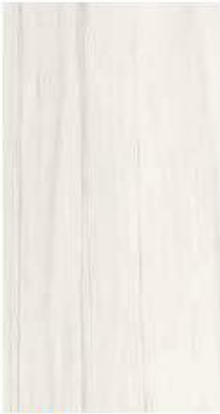
80NA05R NA05 Dolomite Rect. 24"x48" . 60x120 cm