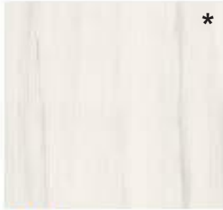
60NA05R NA05 Dolomite Rect. 24"x24" . 60x60 cm