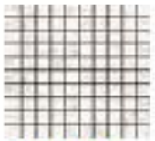
32NA20MO NA20 Carrara Mosaic 1.4"x1.4" . 3x3 cm (sheet 12"x12" . 30x30 cm)