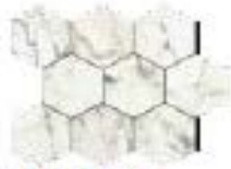
32NA10HEX NA10 Statuario Bianco Hexagon 4"x4" . 10x10 cm (sheet 10"x12" . 26x30 cm)