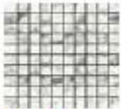
32NA10MO NA10 Statuario Bianco Mosaic 1.4"x1.4" . 3x3 cm (sheet 12"x12" . 30x30 cm)