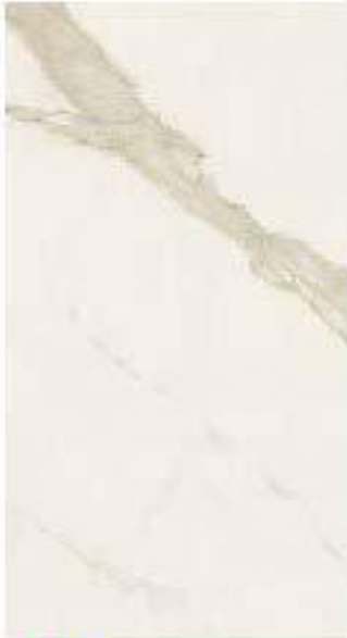
80NA07R NA07 Calacatta Gold Rect. 24"x48" . 60x120 cm