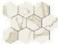
32NA07HEX NA07 Calacatta Gold Hexagon 4"x4" . 10x10 cm (sheet 10"x12" . 26x30 cm)