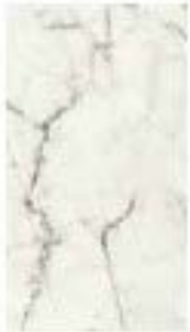
63NA10R NA10 Statuario Bianco Rect. 12"x24" . 30x60 cm