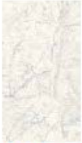
63NA20R NA20 Carrara Rect. 12"x24" . 30x60 cm