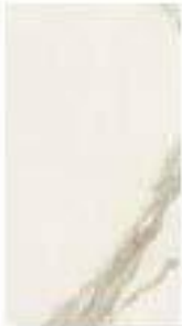
63NA07R NA07 Calacatta Gold Rect. 12"x24" . 30x60 cm