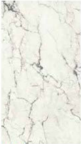
80NA10R NA10 Statuario Bianco Rect. 24"x48" . 60x120 cm